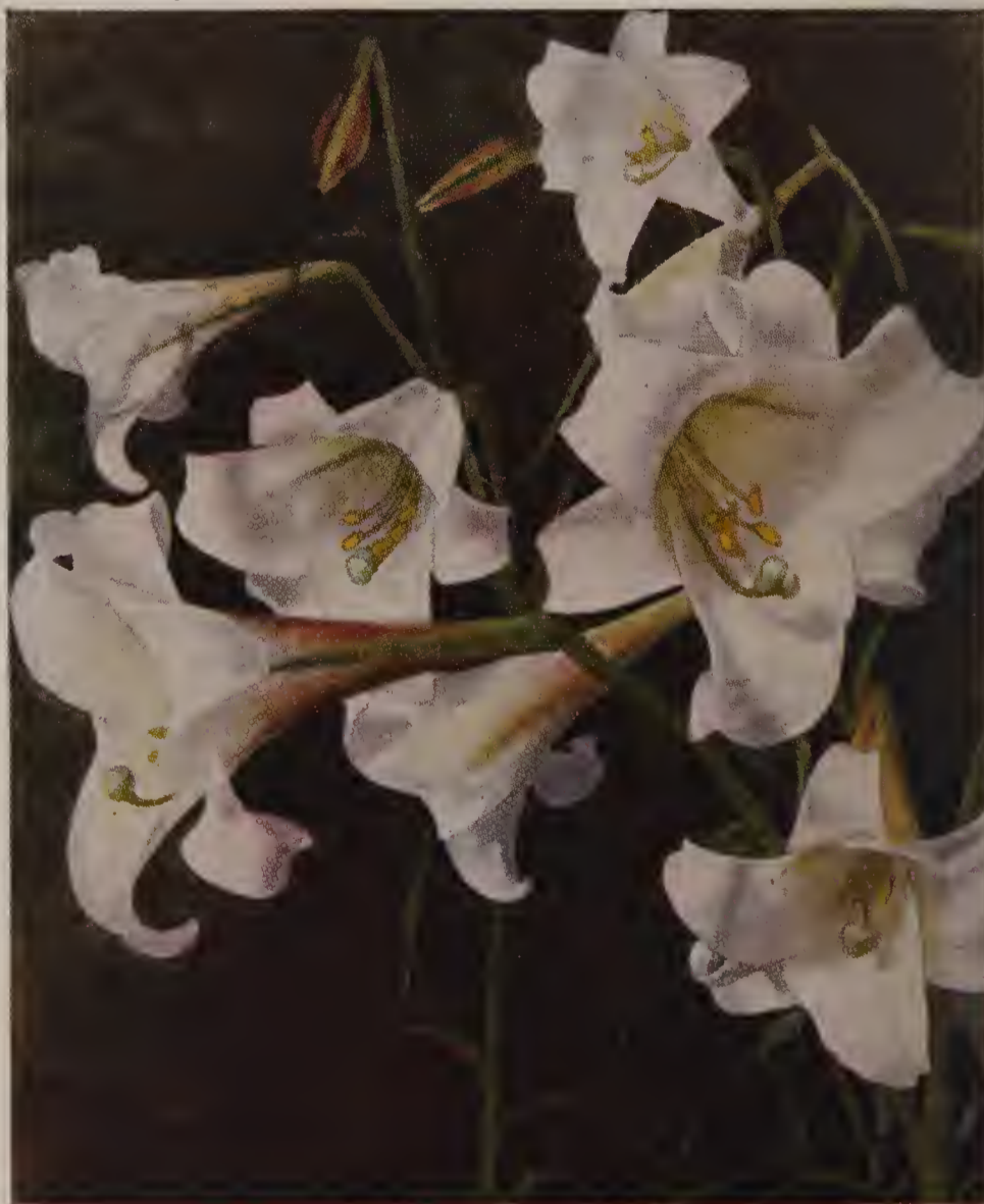
Lilium philippinense formosanum Trumpet shape. White. September-blooming For description, see page 26